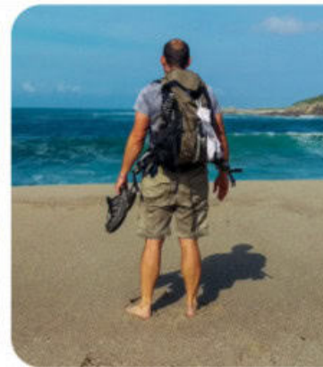
*There is a Camino for everyone! Photos are for inspiration and may differ from your selected itinerary.